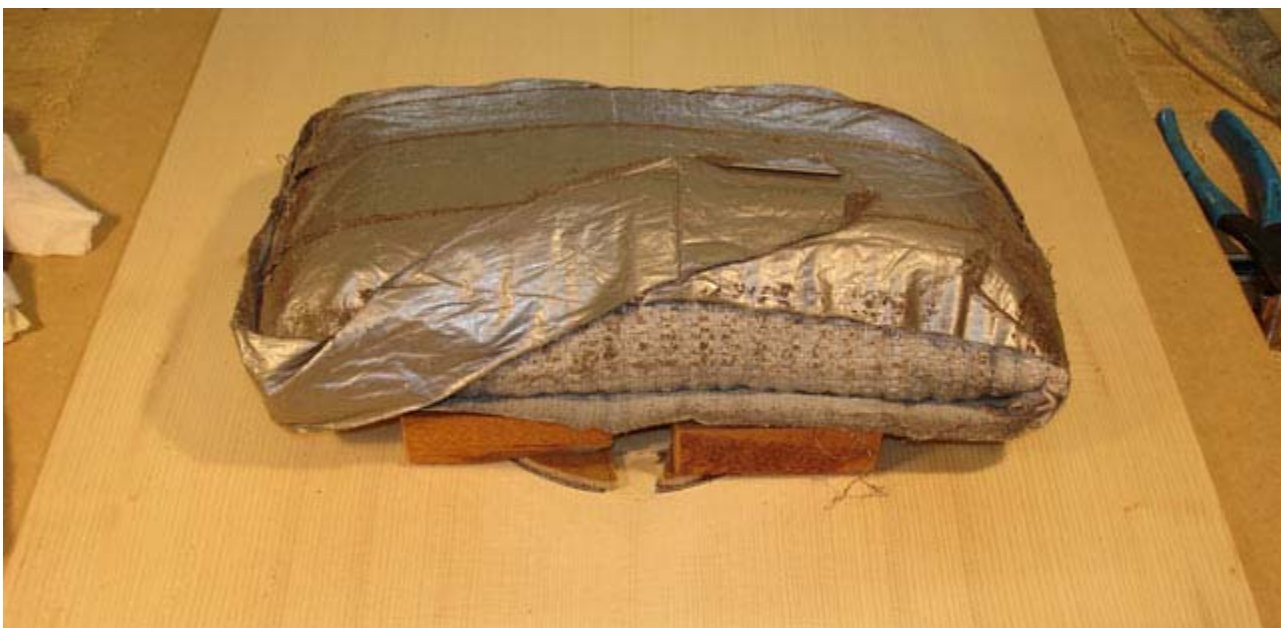
25lb. weight holds the rosette in place on the raw top.